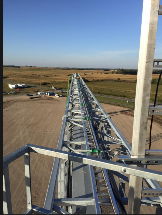
Some of the final cable being installed at KAAPA on the Grain Pile project in Ravenna, NE.