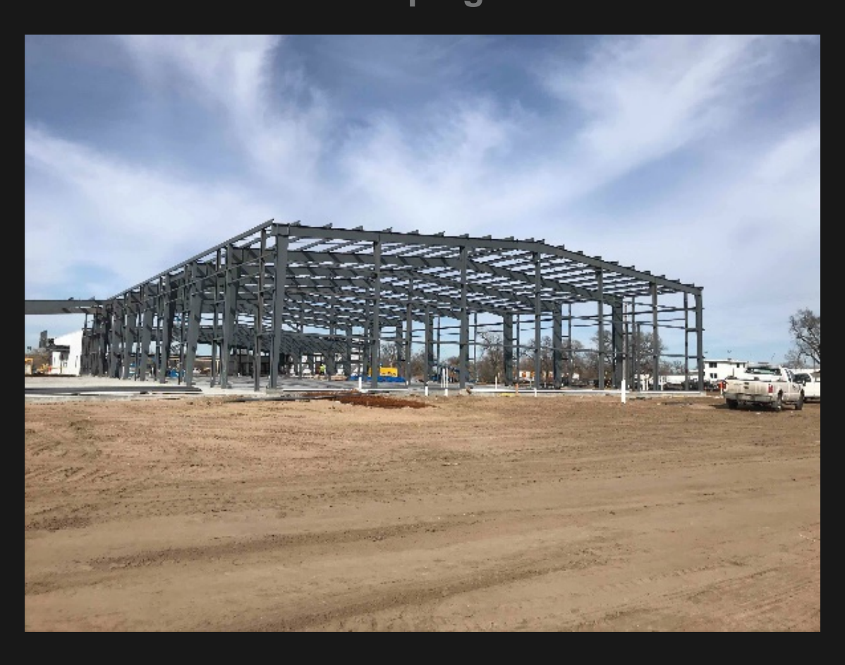
Progress Gander Outdoor/ Camping World